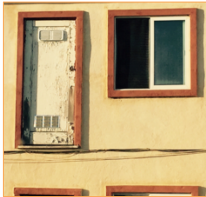
2nd story door, missing stairs