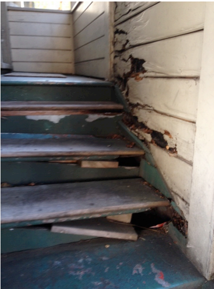
Rotted wall and front stairs

☛ Walk your neighborhood and snap photos of unsafe and unsanitary conditions: rotted wood, missing stairways or railings, mold and trash, like these examples at left and below.